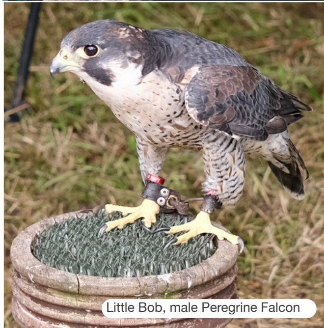
Little Bob, male Peregrine Falcon