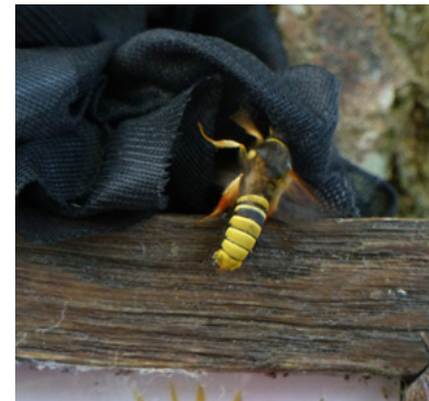
Lunar Hornet Moth to a pheromone lure by the visitor centre.

From Moth Trapping and ID at Cromwell Bottom on 9 July 2023.