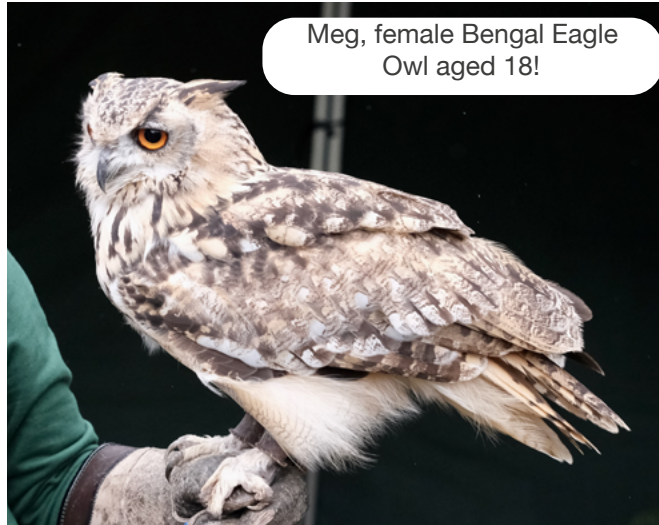
Meg, female Bengal Eagle Owl aged 18!