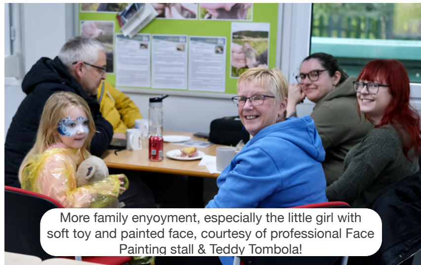
More family enjoyment, especially the little girl with soft toy and painted face, courtesy of professional Face Painting stall & Teddy Tombola!