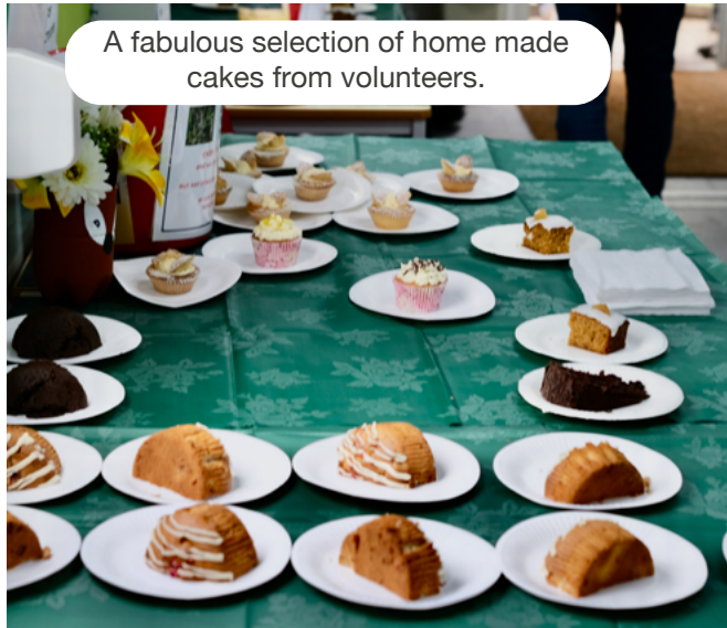
A fabulous selection of home made cakes from volunteers.