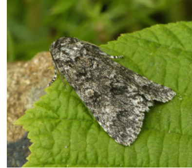
Poplar Grey to light from North Loop.