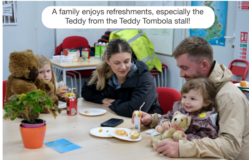
A family enjoys refreshments, especially the Teddy from the Teddy Tombola stall!