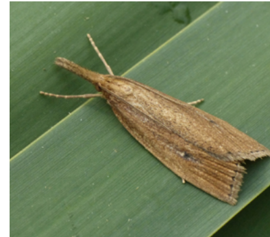
Reed Veneer to light from the lagoon, it's a reedbed specialist